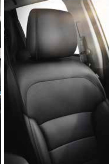
Carbon Black leather upholstery