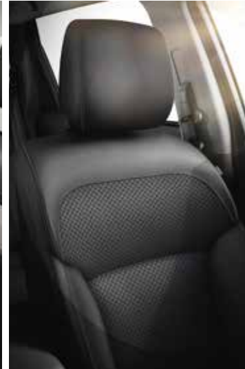
Part-leather & cloth upholstery